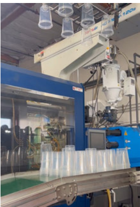
◀ Our factory production line for PP cups