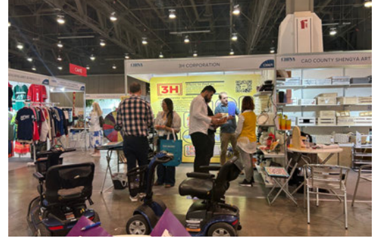
▲ Our booth at ASD Market Week March 2024 with samples from our product line and ▼ attendees inquiring about our services.